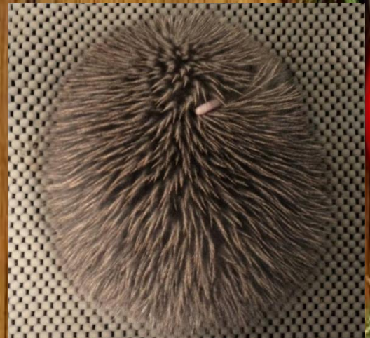
A sleeping Rowi! The bill is barely visible amongst its feathers!