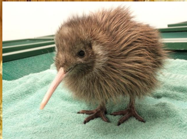
A Haast tokoeka! All ready for release to an outdoor pen!