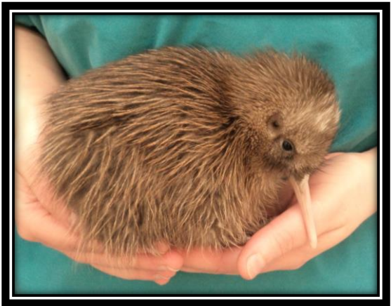
'Tuarua' Hatched 6/11/15